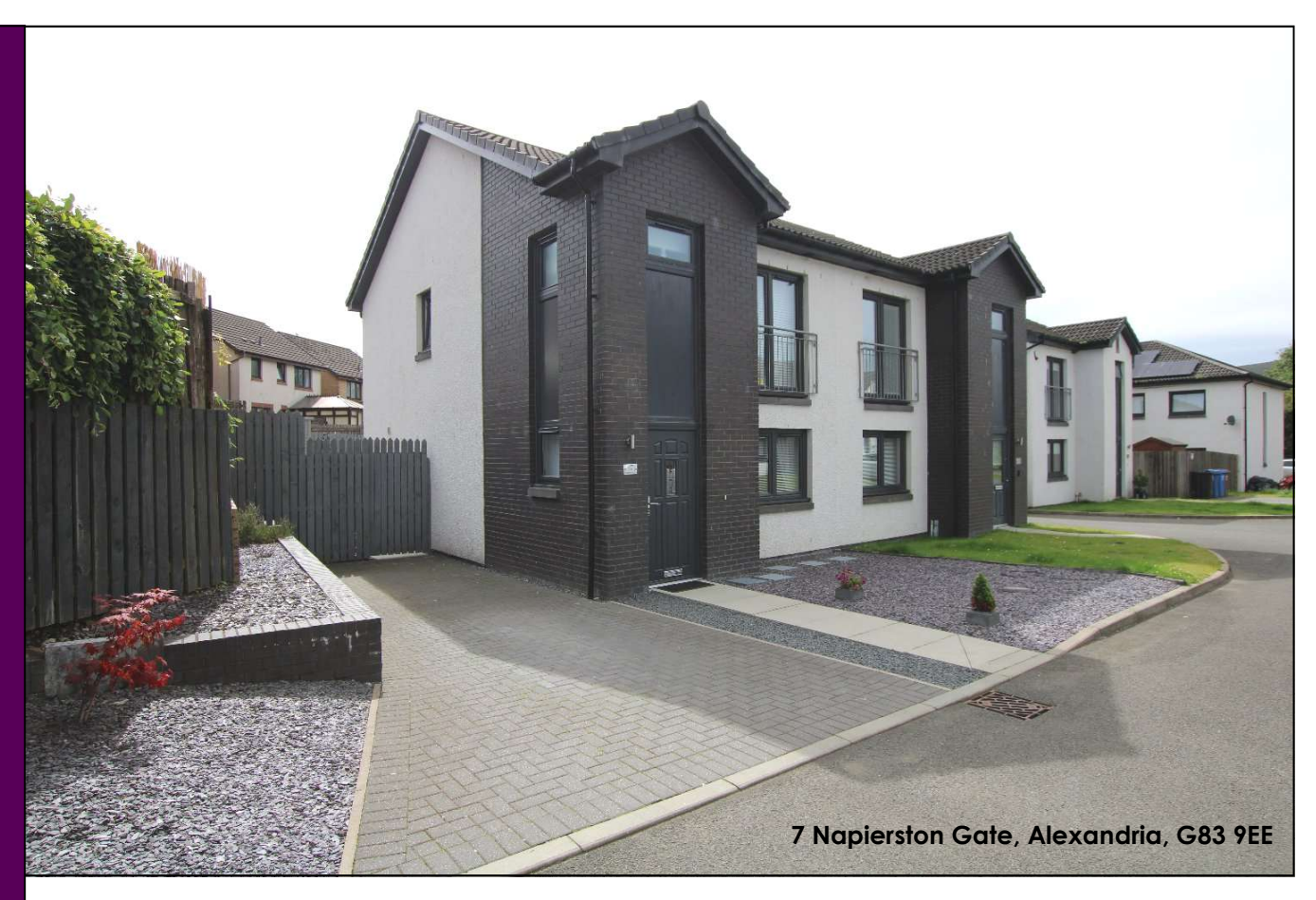
This 3 bedroom semi detached villa is situated at the head of a quiet cul de sac and within an exclusive residential modern development.

GROUND FLOOR 481 sq.ft. (44.7 sq.m.) approx.